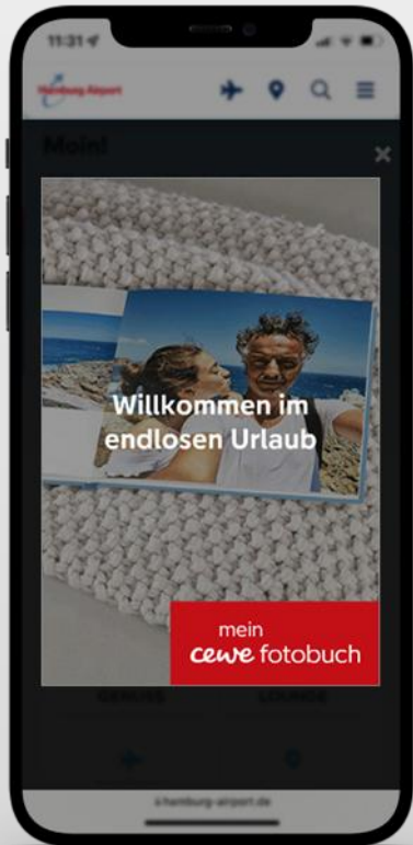
Ad Pos. 1

(Samples / changes and deviations possible)