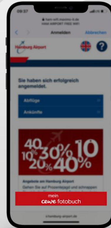
Ad Pos. 3

Before Log-in Branding or Video Area (up to 10 seconds)